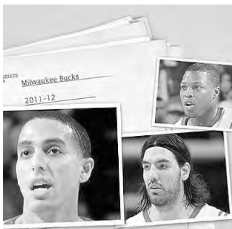
Houston Rockets players

The 2011 NBA lockout is the fourth lockout in the history of the National Basketball