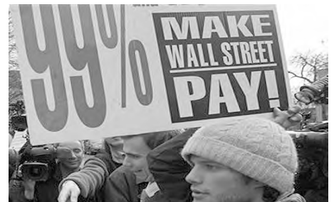
All photos on this page are creative commons.