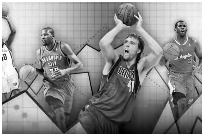
NBA players Illustration [ESPN.com]

Stepping out of the vehicle, the smell of